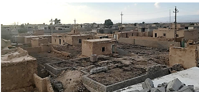
Figure 3: Tal Banat after 2014

Currently about 1,500 households, 7500 individuals have returned to Tal Banat, participants mentioned that more than 200 families are willing to return, and they are expressing interest in returning if essential services are restored. Despite a stable security situation, the return process is hindered by damaged infrastructure, a lack of potable water, and limited electricity. According to Mukhtar of Tal Banat, more families will return once essential services are restored and security is confirmed in Sinjar broadly. Sinjar remains an international conflict area due to the airstrikes and presence of militias (YBS&PMF) and limited access to some areas in general in the level of Sinjar district, but security situation stable in Tal Banat itself as did not registered security incidents in the village of Tal Banat, Many displaced families are awaiting document approvals from the Ministry of Migration and Displacement (MoMD) office in Duhok before returning.