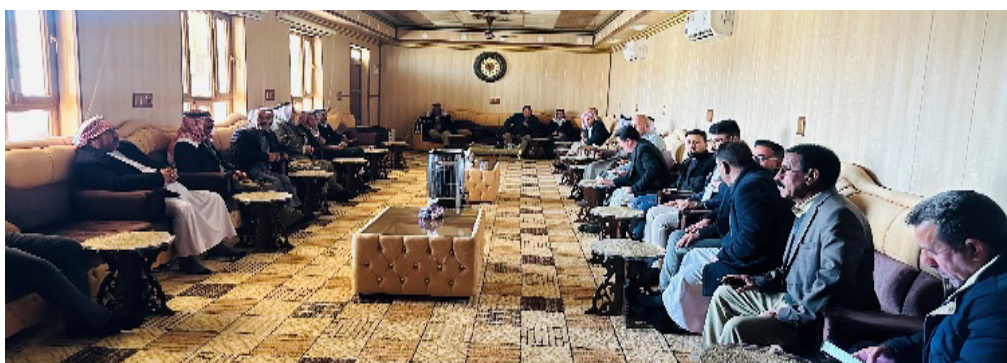
Figure 1: Community representative speaking during the DS community dialogue

The discussion sought to raise the key priorities of the community, the capacity of the local authorities to meet these priorities and the challenges which may need to be overcome.